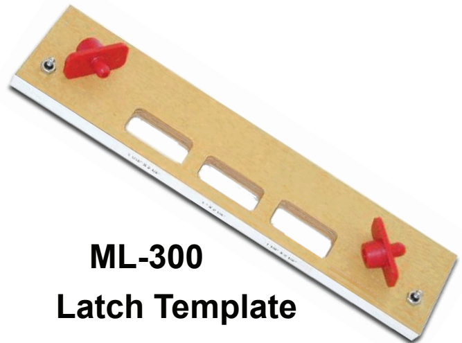
ML-300 Latch Template

Instructions for using both of these templates is virtually the same. The red plastic center locators and the red plastic stops on the underside of the template are used in the same way. The strike template is used on the door jamb and the latch template is used on the edge of the door. Follow the instructions below using a 1/2" hinge mortising bit and a 5/8" OD template guide on your router to create the proper mortises for your jamb and door.